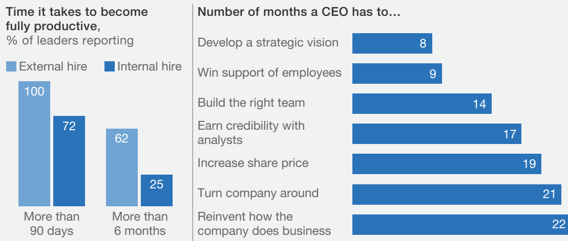
Exhibit 3 The idea that new leaders have 100 days to make their mark is a myth.